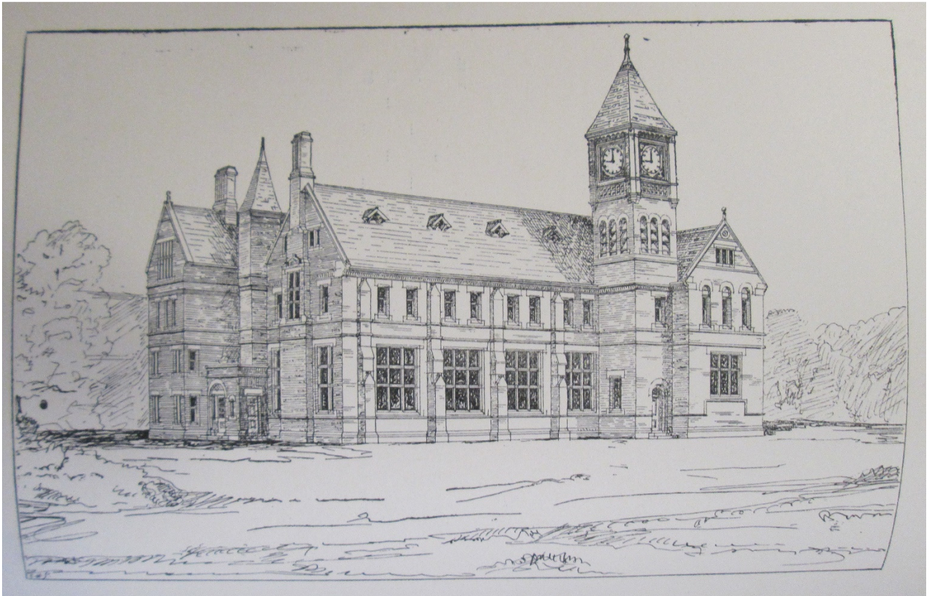
1889 Sketch of the New School Buildings