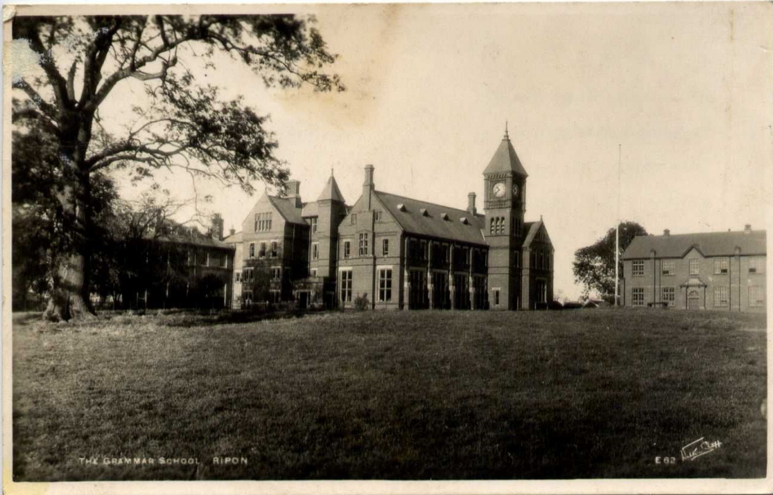
THE GRAMMAR SCHOOL, RIPON