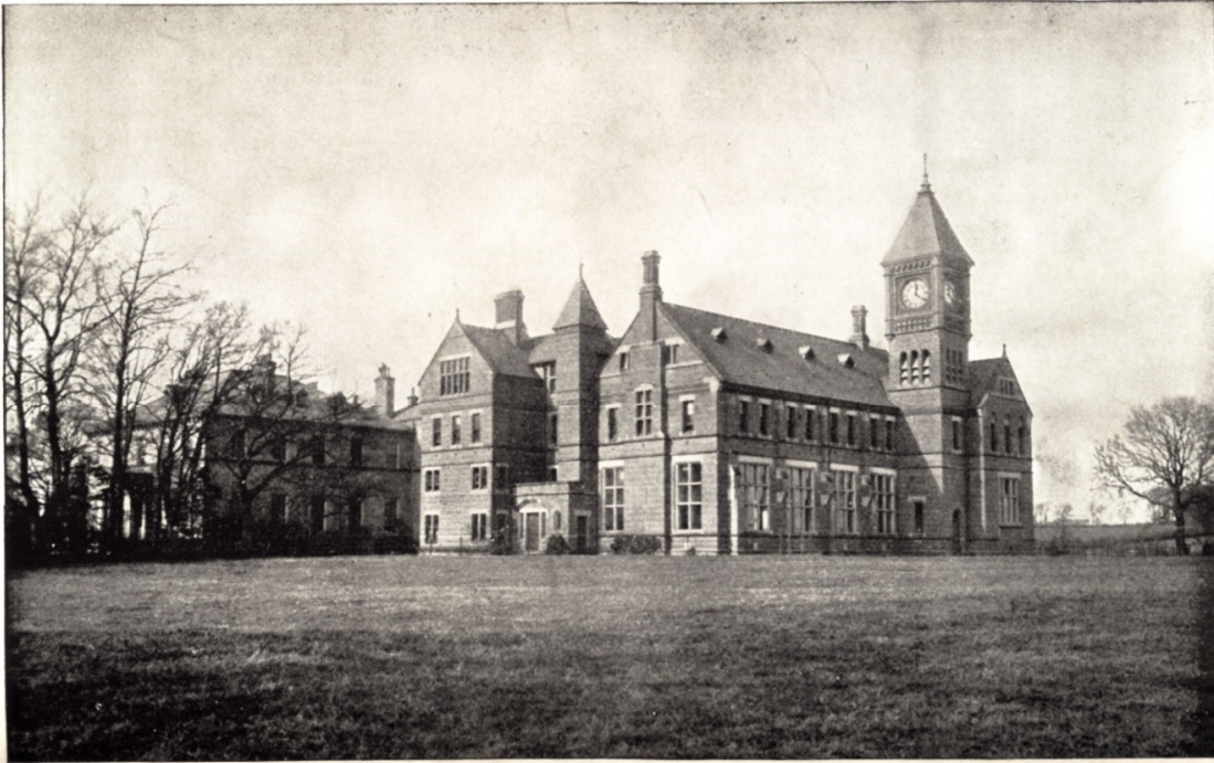
RIPON GRAMMAR SCHOOL, THE MODERN BUILDINGS AT BISHOPTON CLOSE.