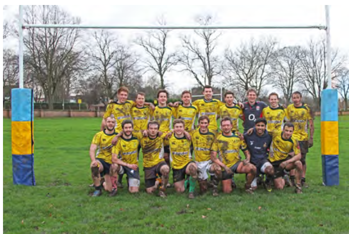
The "over" 21s team