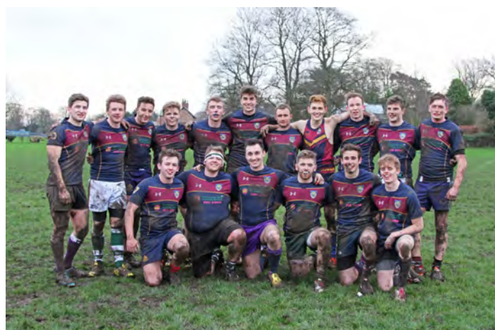
The "under" 21s team

Now in its third year, Old Riponians took the opportunity to catch up with old faces and represent their school in the annual Old Boys rugby fixture. The match saw recent leavers, Old Boys (under 21s (U)), take on the wiser and unbeaten Old, Old Boys (over 21s (O)).