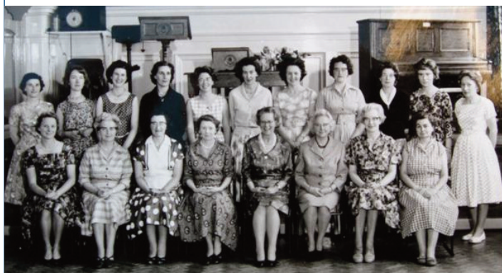
Around two hundred people attended Ripon Grammar School on Saturday, 14th July, 2012 to mark the occasion of the 50th Anniversary of the merging of Ripon Girls' High School with Ripon Grammar School.

The event was organised in conjunction with the Old Riponians' Association to enable former students to share their memories of school in the early 1960's, a pivotal time in the school's history.