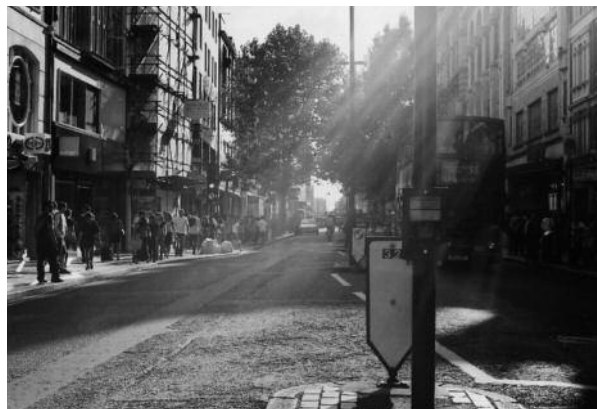
Rory Buckle, U6B