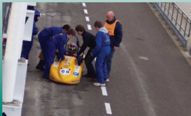
The Electric Chair team at work during a pit stop