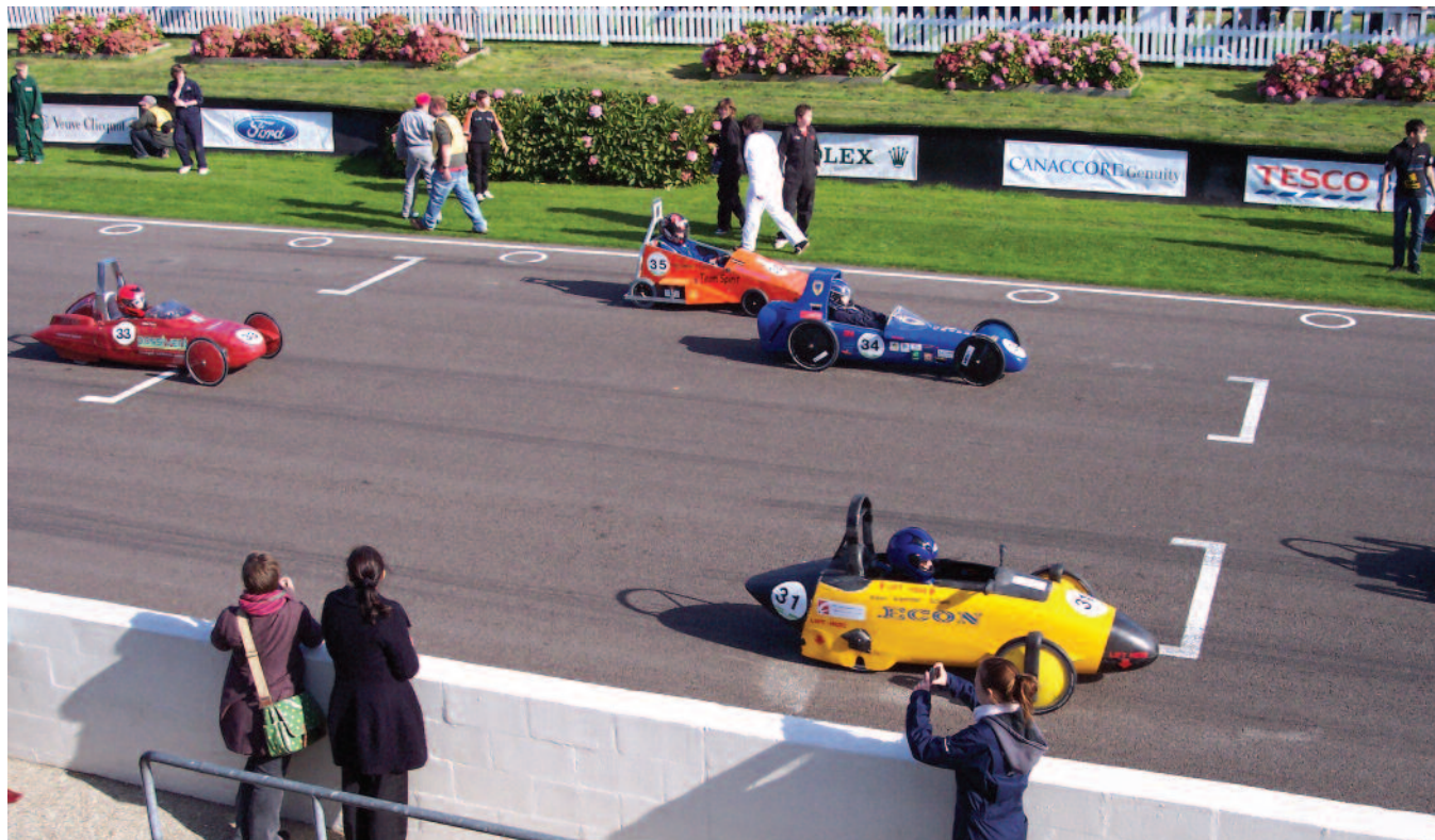
The Carbon Comet gets away cleanly at the start of the four hour race

The RGS Greenpower team enjoyed a superb day of racing at the historic Goodwood motor circuit in glorious sunshine on Sunday 17th October. A convoy of twenty pupils plus staff and parents made the long journey to West Sussex for the eighth year in succession for the highpoint of the Greenpower calendar. There was a reasonable breeze early in the day which made it hard work for the electric powered cars during practice but this dropped to virtually nothing by the afternoon.