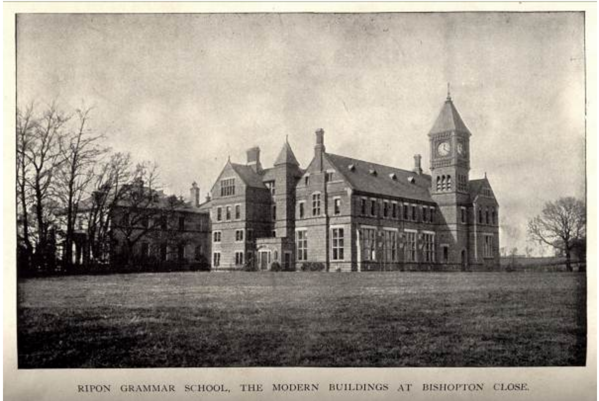
RIPON GRAMMAR SCHOOL, THE MODERN BUILDINGS AT BISHOPTON CLOSE.