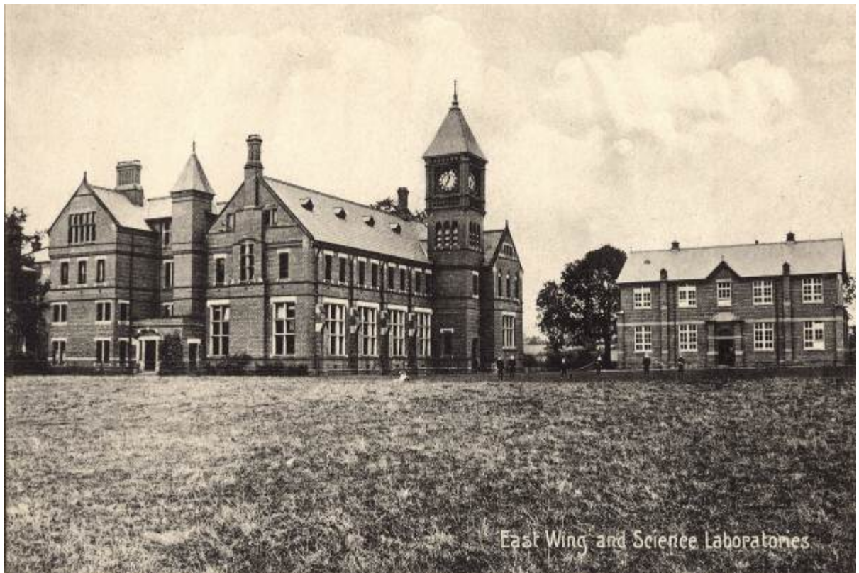
East Wing and Science Laboratories