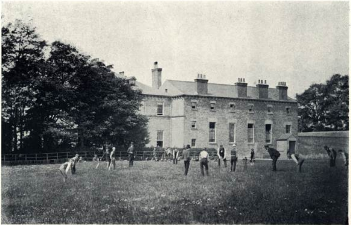
BISHOPTON CLOSE IN THE 1870's.

The room with a figure at the window is now the boarding-staff dining room.